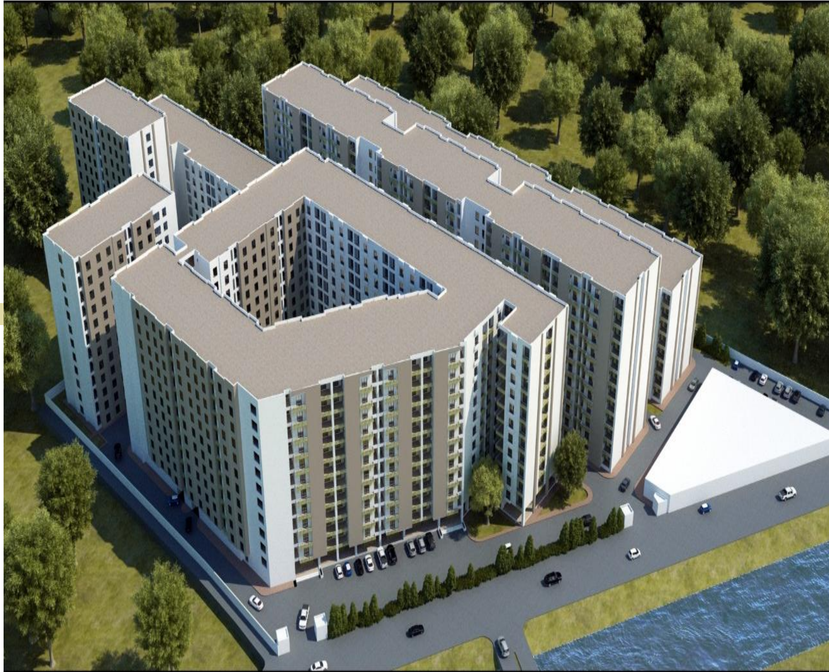
Lifestyle Residency (FGEHA), Bedian Road, Lahore